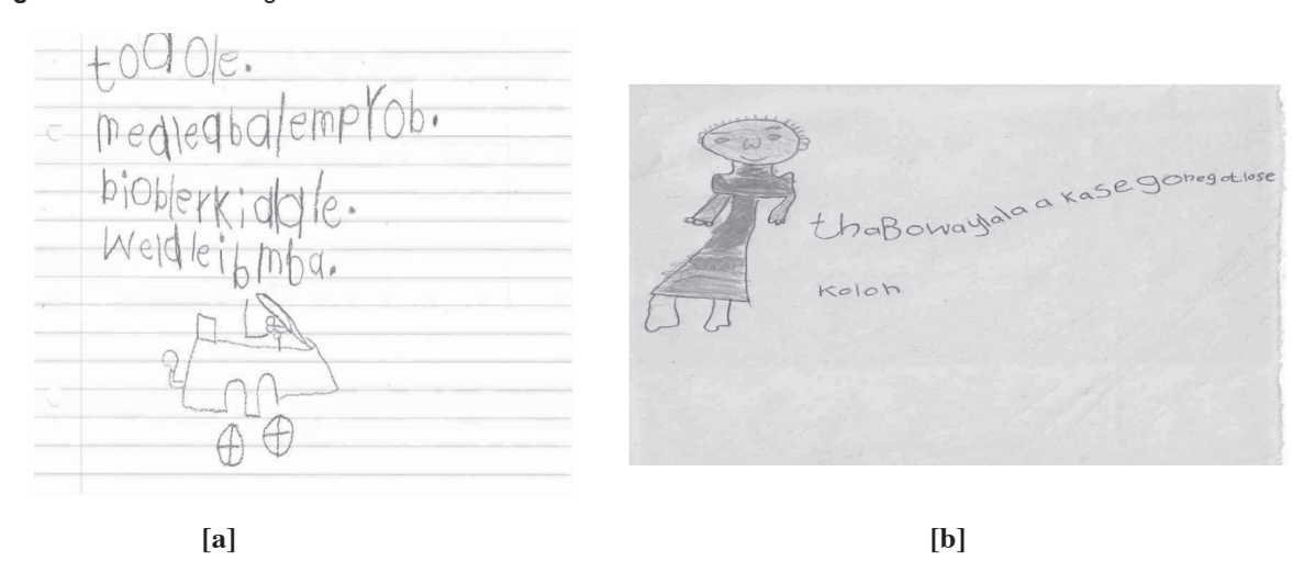
Figure 1: Posttest writing in 2005

Four years later many of the children wrote their letters with confidence and were clearly familiar with this kind of literacy activity. Even though their writing does not yet reflect standard disjunctive orthography in all respects (as in Figure 2 [a] and [b]) they are familiar with the salutation and greeting conventions of this genre of writing.