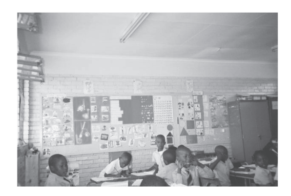
Figure 3: Creating stimulating print-rich environments in Grade 1 classrooms<sup>3</sup>